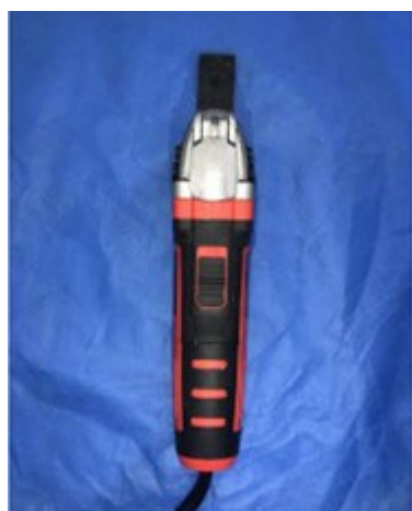
Fig. 2. The used oscillating saw