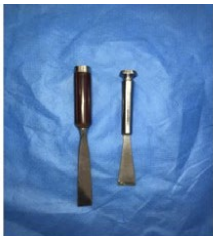
Fig. 1. The used osteotome

(osteotome (Fig. 1), oscillating saw (Fig. 2) and Gigli saw (Fig. 3).