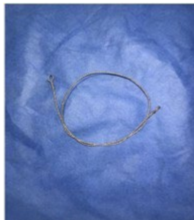
Fig. 3. The used Gigli saw

dose of 8.75 mg/kg BWT (1 ml/20kg bwt I/M). Sedation of animals was done by Xylazine hydrochloride (Xylaject 2% Adwia pharmaceutical Co. 10th Ramadan City. Egypt) at a dose of 0.5 mg/kg I/M (Morgan 1988). Then general anesthesia of animals by Propofol 1% B.Braun Germany 5 mg/kg BWT I/V (Sano et al. , 2003).