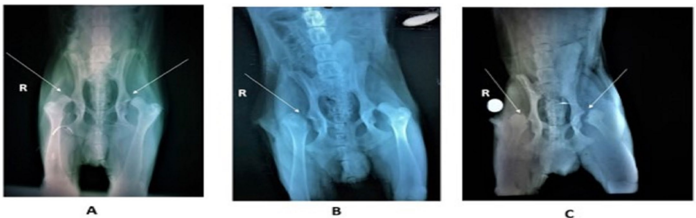
Fig. 4. Hip dysplasia pre and post-operative using osteotome; (A) showing hereditary bilateral hip dysplasia in 6 months male golden retriever dog; (B) showing the postoperative FHO for the right hip; (C) after 3 months post-operative FHO for the left hip.

In the current research, CHD was caused by a combination of hereditary and environmental factors as agreed by Mäki et al. (2002), and Nouh et al. (2014) who stated that CHD is a hereditary malformation that develops during periods of rapid growth. Each of these dysplasias can cause arthritis and/or severely deformed joints, disabling the dog Hip dysplasia has been reported as a quantitative trait occurring in numerous breeds. All cases with CHD in this research don't have a history of trauma that prove that it was a hereditary disease and all cases from different breeds indicate that CHD is not restricted to a certain breed. Slatter (1993) stated that hip luxation mostly occurs craniodorsal that result was in accordance with this study as 2 of 3 hip luxation cases in femoral head position were craniodorsal. Fossum (1997) reported that luxation of the femoral head and lodged in the obturator foramen is usually due to falling trauma, which in accordance with the obtained findings as one of two dogs suffering from hip luxation of the femoral head luxate and lodged in obturator foramen. (Harper, 2017) stated that FHO is a salvage surgical procedure in dogs. Active use of the limb may take over 1 month and rehabilitation times of 6 months or more are common. This result was accepted in this study as all cases after