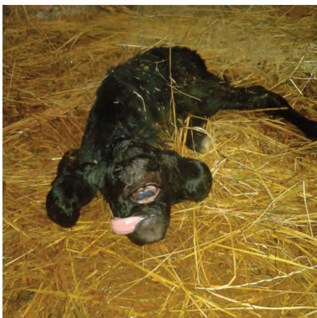
Fig. 1. Cyclopia monster calf

of the nose were absent and the area was covered with skin above the centrally located eye (Fig. 2). The lower jaw was longer than the upper jaw leading to protrusion of tongue from base outside the mouth. The calf had a dome shaped head, centrally located orbit with protruding tongue giving it a monkey face like appearance. The calf was unable to stand after its delivery due to ankylosed limbs. Colostrums was fed to the calf with the help of bottle. The fetus died 8 hours after its successful delivery.