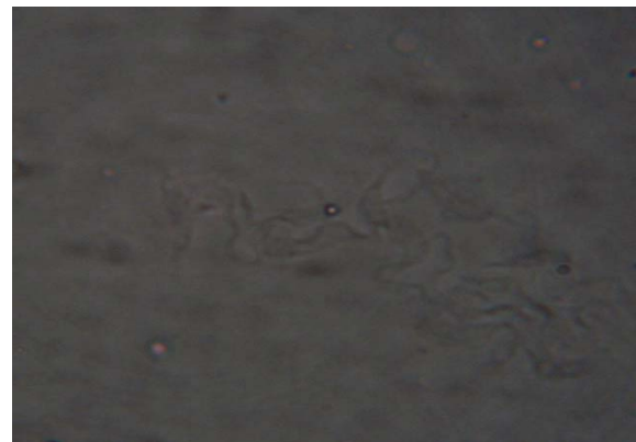
Fig. 2. Negative reaction to SELISA

Another novel application of the test reported in literature pertains to use of the assay as a screening test in hybridoma antibody generation against Babesia bovis (Kungu and Goodger, 1990). These authors reported that the test was 79.94% and 89.47% sensitive in detecting Babesia bovis specific antibodies at 12 and 36 months after the single infection in cattle maintained under tick-free conditions. Although Kungu and Goodger (1990) reported that the test slides can be read microscopically for least a week at room temperature, but in the present study, the test reaction was found to be stable even up to 15 days after the test. Taking into considerations the requirements of the test, repeatability, simplicity, cost effectiveness and its acceptability in the field conditions, SELISA could emerge as a test of choice for the detection of antibodies against T.evansi infection in cattle and buffaloes in developing countries.