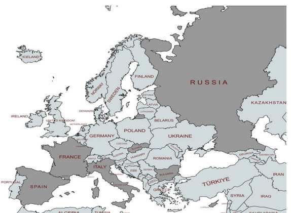
Fig. 2. Map with the European countries that have reported cases in wild birds since 2007 marked in dark grey. Created using https://mapchart.net/europe.html .

The role of birds as a natural reservoir of C. burnetii has already been confirmed and detected in several countries (Figure 2). The involvement of avian populations in the epidemiology of C. burnetii was first suggested in the 1950s (Babudieri and Moscovici, 1952; Raska and Syrucek, 1956), with the first report of wild bird infection by C. burnetii (Babudieri and Moscovici, 1952), continued into the 1970s (Enright et al. , 1971), and having gained more attention in recent decades.