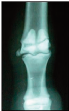
Fig. 2. Dorsopalmar radiograph of the metacarpophalangeal region reveals chip fracture of the proximal phalanx with midbody fracture of the proximal sesamoid bones.