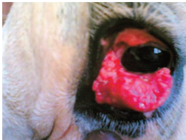
Fig.1. Nictitans gland tumor in the third eyelid.

crease in size, the growth was irregular and hard (Fig.1). Hematological and biochemical parameters were within the normal physiological limits (data not shown). It was diagnosed as a case of tumor involving the left third eyelid and the mass was surgically excised.