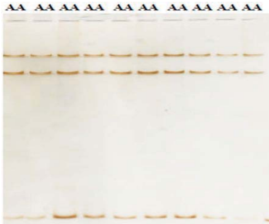
Fig. 2. PCR-SSCP genotypes of 269 bp fragment of CXCR2 gene

A small 269 bp fragment of CXCR2 gene was amplified (Fig. 2), followed by SSCP analysis. The SSCP analysis of 269 bp fragment of CXCR2 gene revealed same patterns in all samples of cattle. Thus only one genotype was found for this fragment of CXCR2 gene. A 269 bp fragment of CXCR2 gene was sequenced by Sanger's dideoxy chain termination sequencing method in automated ABI Prism DNA sequencer. The sequences ob-