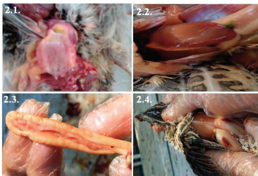
Plate 2. Lesions found in the internal organs after challenging quails with NDV. 2.1) Slight congestion on the mucosal surface of proventriculus. 2.2) Congestion of the liver especially on the boundaries. 2.3) Congestion of pancreas. 2.4) hemorrhages on the thigh muscles.