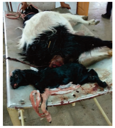
Fig 1. Male dead fetus lying alongside of the Goat