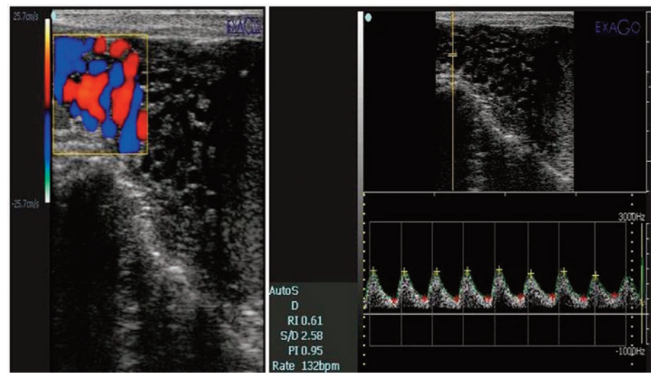
Fig. 2. Ultrasonographic scanning of the fat-tailed ram testis using color pulsed-wave Doppler ultrasonography showing blood flow within the testicular artery (left side). Blood flow within the supratesticular artery revealed a spectral pattern for measurement of blood flow indices within the testicular artery (right side).